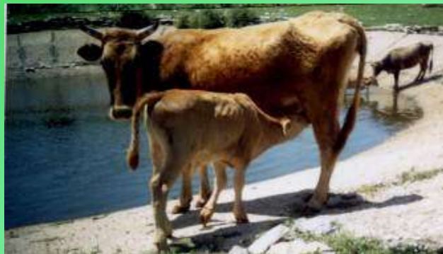
Ilyric Dwarf Cattle “Lopa Gurgucke” 130 – 180 heads