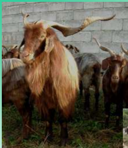
“Capore e Dragobise” 3500-3800 heads