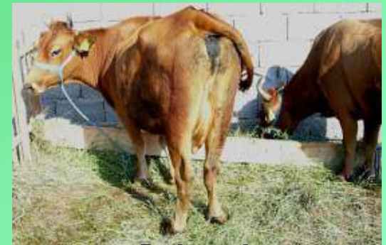
Busha cattle 250- 300 heads