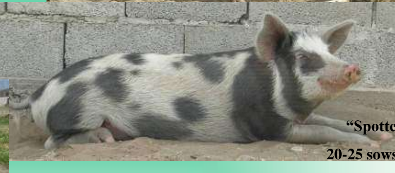
“Spotted of Scutari” 20-25 sows and 5-7 boards