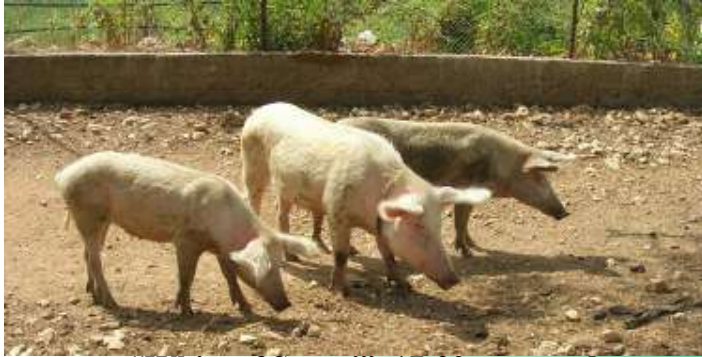
“White of Scuari” 17-20 sows and 4-5 boards

Pig - 3(three) rare and endangered local breeds have been identified: