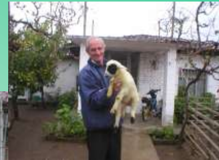
“Spotted of Polisi”