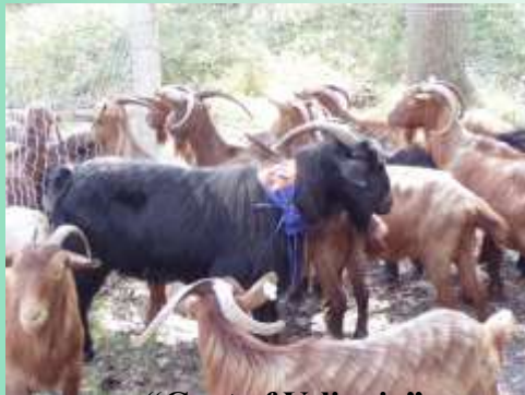
“Goat of Velipoja” 900-950 heads