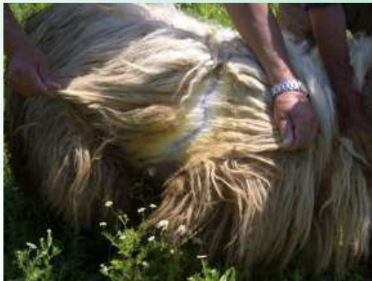
“Shkodrane“ sheep breed