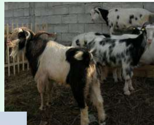
“Spotted of Kallmeti” 850-900 heads