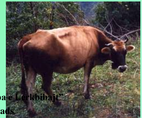
Ilyric Dwarf Cattle “Lopa e Lerkbibajt” 450 – 500 heads