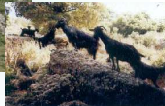
“Black of Dukati” 1800-2200 heads