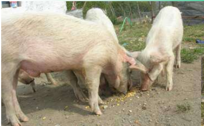
“ Pig with wattles” 2 sows and 1 board