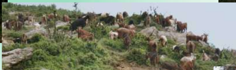
“Capore e Mokrres” 350-400 heads