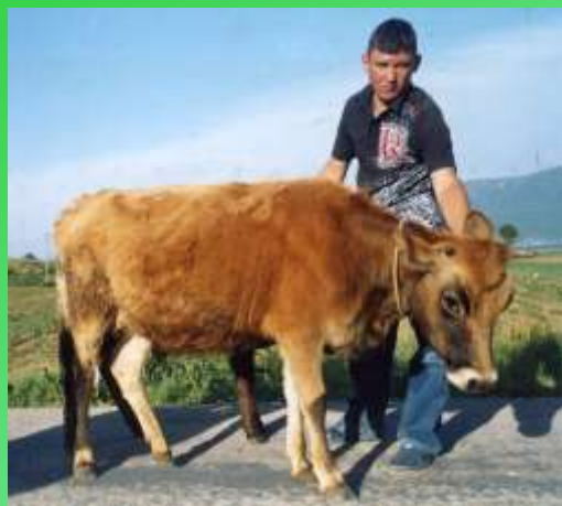
Lopa e Prespes 350- 400 heads

The local breeds that are at risk of extinction: